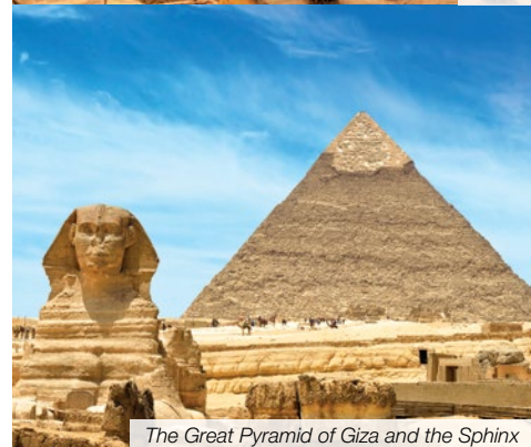
The Great Pyramid of Giza and the Sphinx