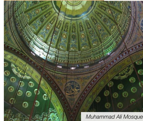
Muhammad Ali Mosque