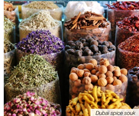
Dubai spice souk

GREENHILLS TRAVEL CENTRE 5-9 Mitchell Drive, East Maitland NSW 2323 02 4931 0300 • travel@greenhillstravelcentre.com.au www.greenhillstravelcentre.com.au