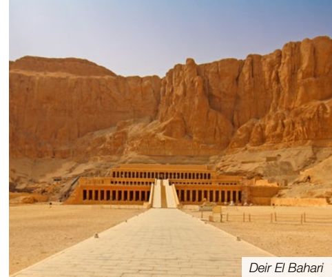
Deir El Bahari

The most important thing to bring on holidays is your... sense of humour.