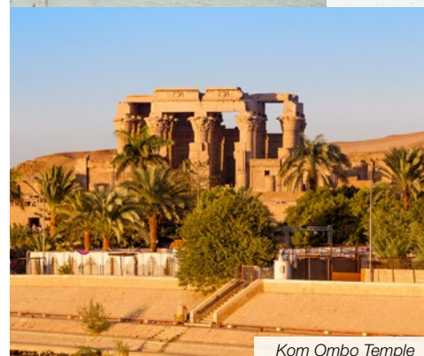
Kom Ombo Temple